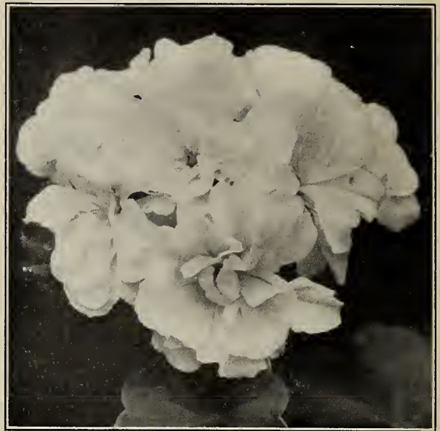
Dina Scalarandis—See page 15